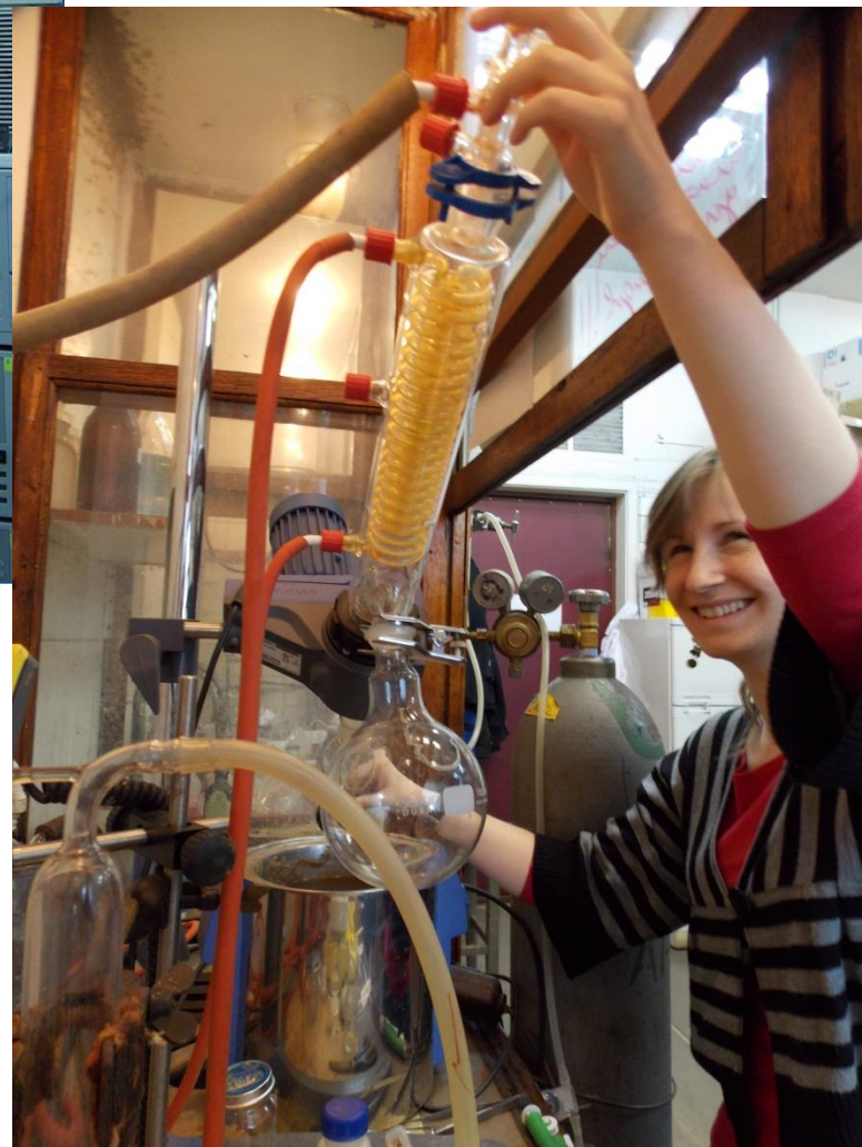
A physico-chemist, UWR, in synthetic lab, INEOS RAS, May 2012.